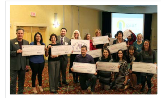
At the 2014 GAAR/SWMLS Annual Meeting

At the Annual Meeting, local charities are presented with a check from the REALTOR® Fund during the GAAR Grant Giveaway. The REALTOR® Fund gifted $46,700 in 2015 to worthy local charities.